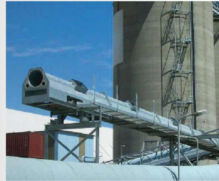
Material Handling Equipment