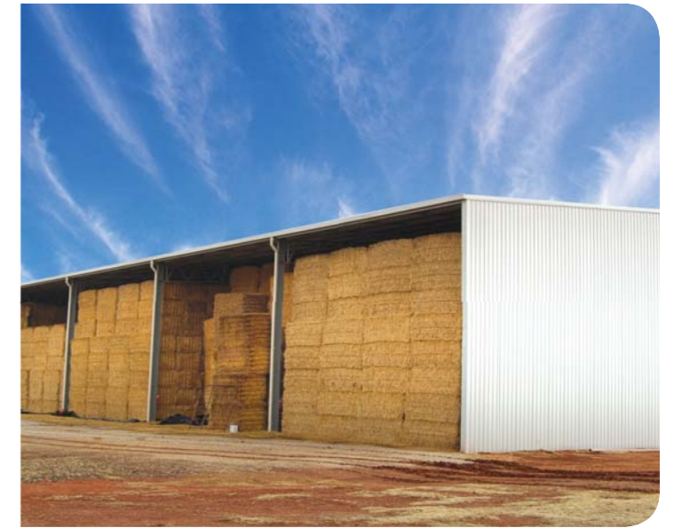
Industrial & Rural Sheds