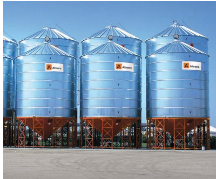
Large Elevated Silos