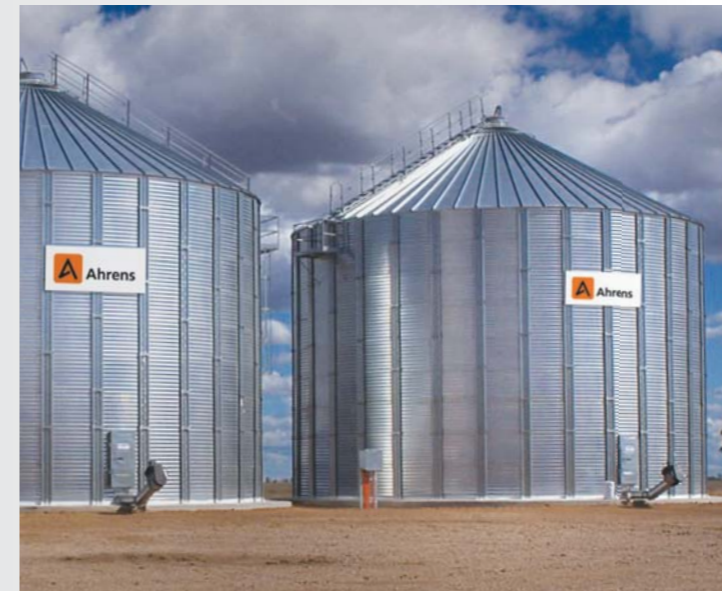
Flat Bottomed Silos